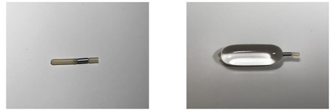
FIGURE 2 Smart-TO™ device, uninflated (left) and inflated with 0.7 mL saline (right). This is an experimental tracheal occlusion device with similar dimensions as the device used so far, but with a magnetic valve. This permits non-invasive opening of the valve by exposure to the fringe field of a clinical magnetic resonance imaging device. 41 [Colour figure can be viewed at wileyonlinelibrary.com ]

Reduction in FETO-related adverse outcomes could be achieved with technical improvements in endoscopy and occlusion devices. We aim to achieve further miniaturization of the endoscopes, but working on instrumentation has become increasingly difficult due to the (unintended) consequences of the new Medical Device Regulation in Europe. We have successfully completed preclinical studies with the “Smart-TO”-balloon (BS Medical Tech Industry, Niederroedern, France; Figure 2). 41 This balloon has a magnetic valve that opens by exposure to a strong magnetic field, that is the fringe field around an magnetic resonance imaging (MRI) scanner. After deflation, the balloon is either swallowed by the fetus or exits the mouth into the amniotic fluid. Tests in large animal models confirmed that this device