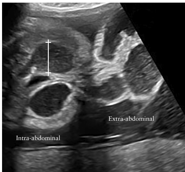
Figure 1 Ultrasound image of cross section of abdomen in fetus with gastroschisis, demonstrating intra- and extra-abdominal bowel dilation. Calipers and line indicate diameter of dilated intra-abdominal bowel segment.

Data on pregnancy outcome were collected from the hospital records of the mother and baby. The primary outcome for the study was complex gastroschisis, defined as the presence of intestinal atresia, stenosis,